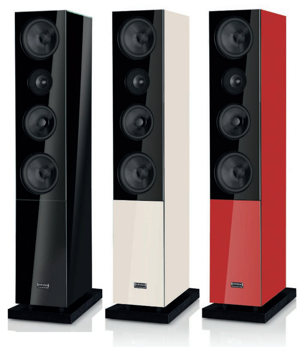
The Classic 35 are available in numerous colour variants as from 4,790 euros per pair. On request, Audio Physic can also supply the Classic 35 in special colours for additional 200 Euros