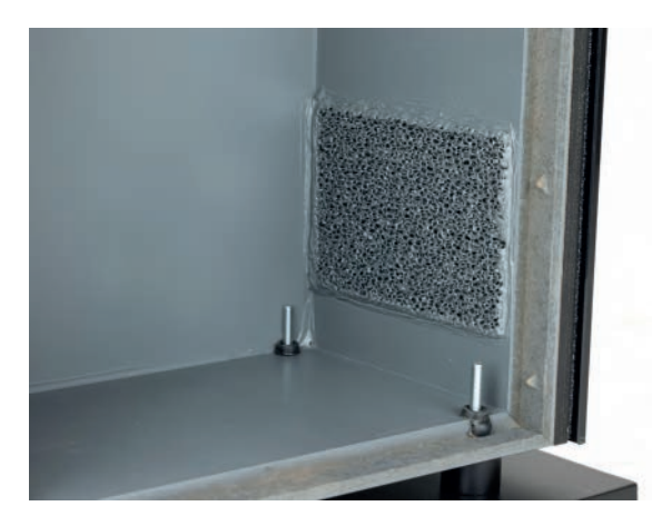
The ceramic foam plate in the Classic 35 is positioned in front of the bassreflex vent as a damping element and helps to minimize flow noise

Waterfall Diagram The transient behaviour of the Classic 35 is absolutely exemplary. Above 500 Hertz, the loudspeaker comes to rest extremely quickly.